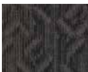
589 Natural Influence